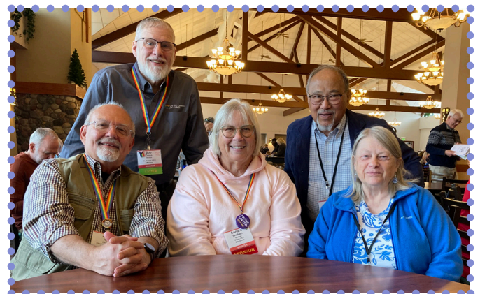
Christ Church members at Wisconsin Conference UCC Annual Meeting